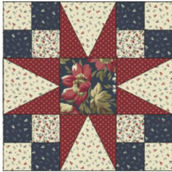
Star Block -->

9. Sew a Row 1 from Step 7 to the top of a Row 2 from Step 8. Rotate and sew another Row 1 section to the bottom of Row 2 to complete the block. Square up to 9 1/2". Make (21).